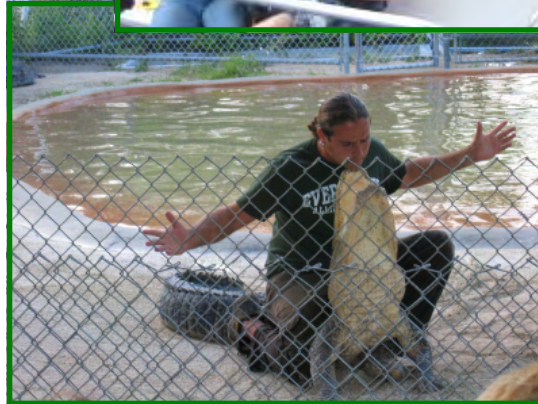
And you thought your job was risky!